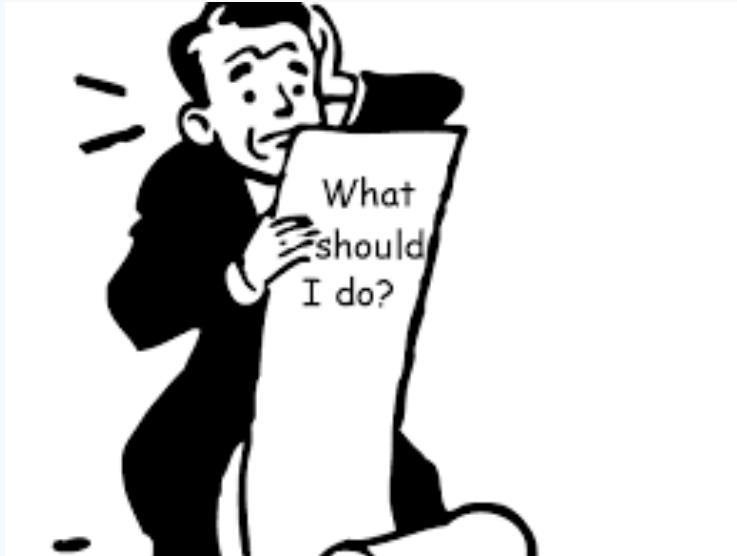
Determining our role