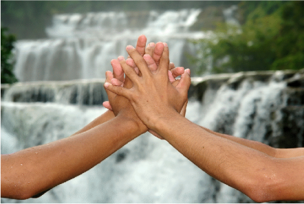
The Virginia Safer By Design Coalition demonstrates how networking partnerships can effectively promote CPTED